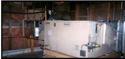
NEW - 2 EA AIR HANDLING UNITS (AHU)