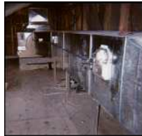
AHU AND AIR DUCTS