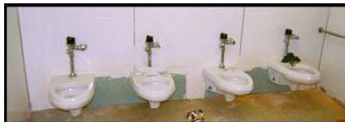
WOMEN'S BATHROOM DURING CONSTRUCTION