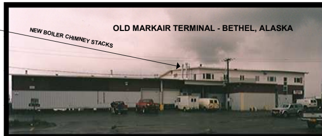
OLD MARKAIR TERMINAL - BETHEL, ALASKA NEW BOILER CHIMNEY STACKS