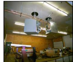
NEW HOT AIR FURNACES - CARGO