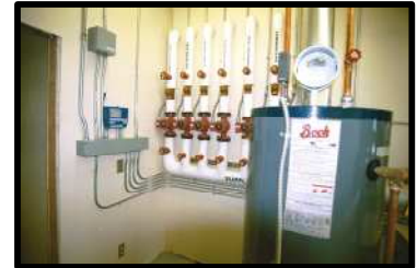
BOILER PUMP HEADER - EMS SYSTEM