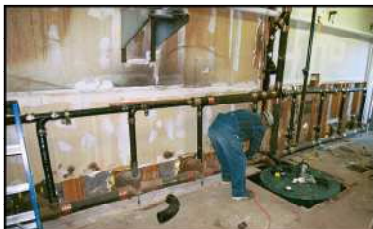
WASTE & VENT - LIFT STATION