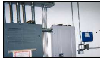
ENERGY MANAGEMENT SYSTEM FOR OIL FIRED BOILERS