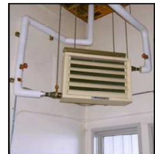
NEW UNIT HEATERS