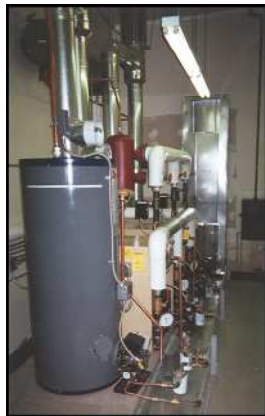
NEW BOILERS & HW HEATER